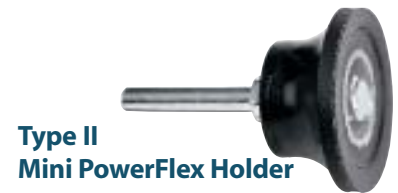
Type II Mini PowerFlex Holder Part # 08834168539