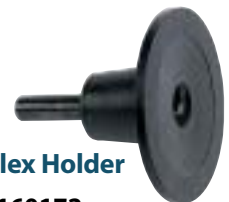
Type III Mini PowerFlex Holder Part # 08834160172