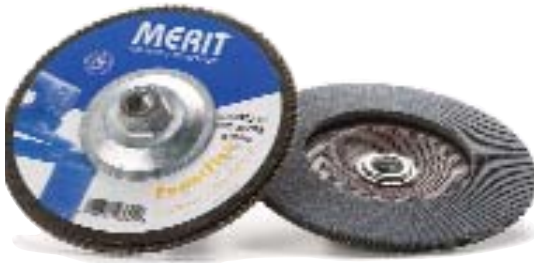
Zirconia Fiberglass 5/8-11 Hub