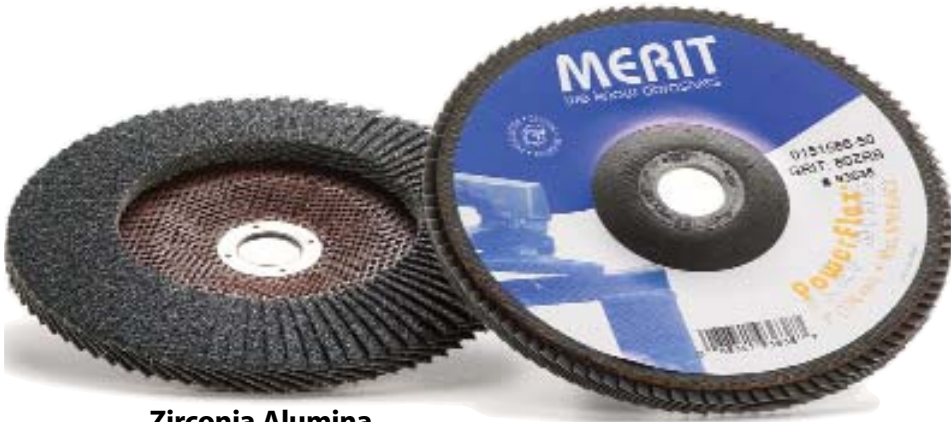
Zirconia Alumina Fiberglass Plate