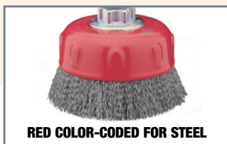
RED COLOR-CODED FOR STEEL

For light- to medium-duty brushing applications on flat or irregular surfaces, and bevel buffing.