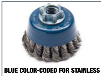
BLUE COLOR-CODED FOR STAINLESS

High-impact cutting and cleaning on more demanding applications such as heavy deburring, weld cleaning and cleaning larger surfaces.