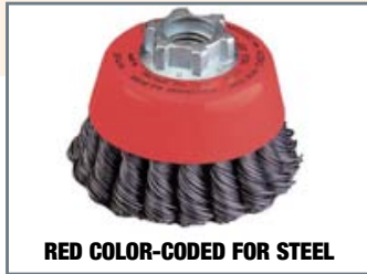
RED COLOR-CODED FOR STEEL