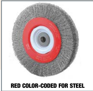
RED COLOR-CODED FOR STEEL