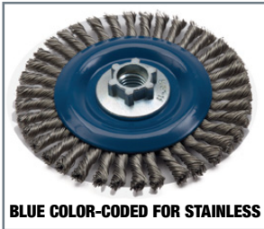
BLUE COLOR-CODED FOR STAINLESS