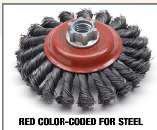
RED COLOR-CODED FOR STEEL

Ideal for cleaning corners and other hard to reach areas.