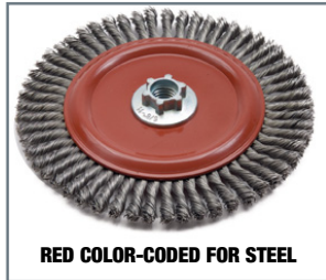
RED COLOR-CODED FOR STEEL