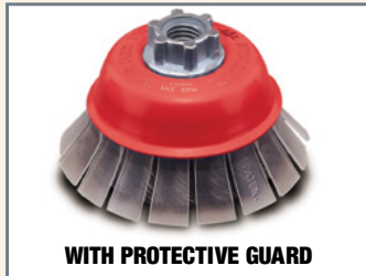
WITH PROTECTIVE GUARD